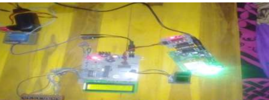
Fig 5.2:Hardware photo

The fingerprint voting system has a fingerprint scanner as a user interface which will be replaced by fingerprint databases exist in the internet in order to test the system with. The fingerprint voting system has a fingerprint scanner as a user interface which will be replaced by fingerprint databases exist in the internet in order to test the system different type of fingerprint scanner instead of one type, as well to reduce the system' scost. The system has two modes, the enrolment and authentication modes. The enrolment mode handles the registration process in order to register the eligible users in the system; the output of the enrolment mode will be store in the database of the system. The second mode which is the authentication. mode handles the process of checking the eligibility of the user by taking the user's fingerprint and matches it with the database's fingerprints; if the system found any similar fingerprint in the database then the user is eligible to cast his vote. The vote of the user will be count and store in the database. At the end of the voting process the user can check the election result by clicking the result.button