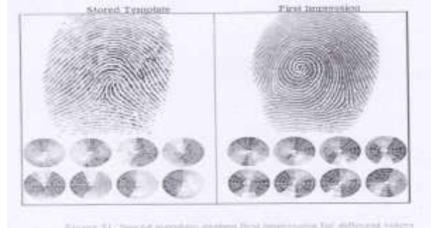
Fig 6.1: Stored template against first impression for different voters

In the figure below two fingerprint images have similar shape are shown. These two fingerprint images belong to two different voters. The finger code of these two images will differentiate them even if they have similar looking. The threshold has value of 715 and its represent the minimum distance between the fingercode of these two images. If the minimum distance between two fingerprints is lesser than 715, that's mean the two fingerprint are matched and belong to the same person while if the value is more than 715 then the two fingerprint is different and it's belong to two different voters. The two fingerprints in the figure below have a minimum distance of 1713.35, that's means these two fingerprints are different and belong to different persons, even if the two fingerprints appear similar.