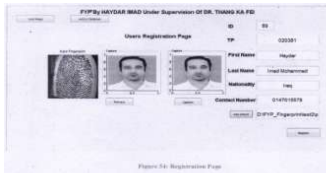
Fig 6.3: Registration Page