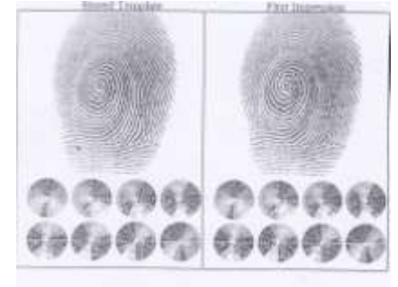
Fig 6.2:Stored Template against first impression for same user

.On the other hand 2 fingerprint images and their corresponding finger codes belong to the same person shown in the figure below. The minimum distance between these two fingerprint images is 420.2 which are lesser than the threshold value, that means these 2 fingerprint images belong to the same person and the person is eligible to cast his vote.